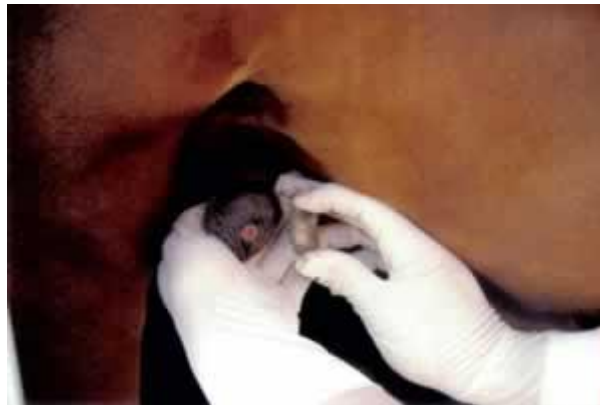
Photo 1. A large bean like this can surely cause great discomfort for the horse.

A s we travel the world teaching our bodywork, we continue to find that examining and cleaning of geldings' and stallions' sheaths is not as routine as it should be. In some countries, the horse caregivers - and veterinarians - have not heard of the importance of this 'hygiene'. Yet it is simple enough to do yourself.